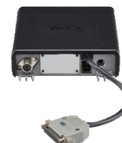
Optional OPC-2078 installation image