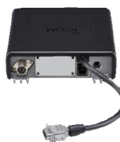
Optional OPC-1939 installation image